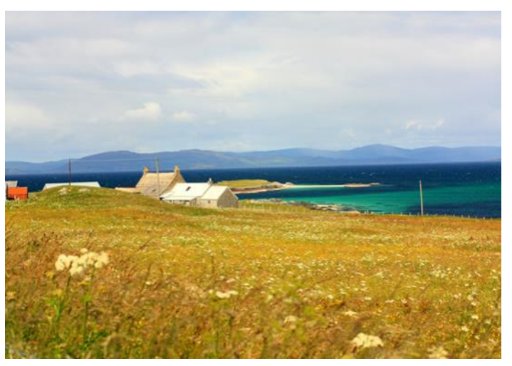
Day 5 - Friday 26<sup>th</sup> July lona - Journey home

The rest of the afternoon will be free for reflection and prayer. We will finish the day with Evening Prayer and Address followed by a farewell dinner together.