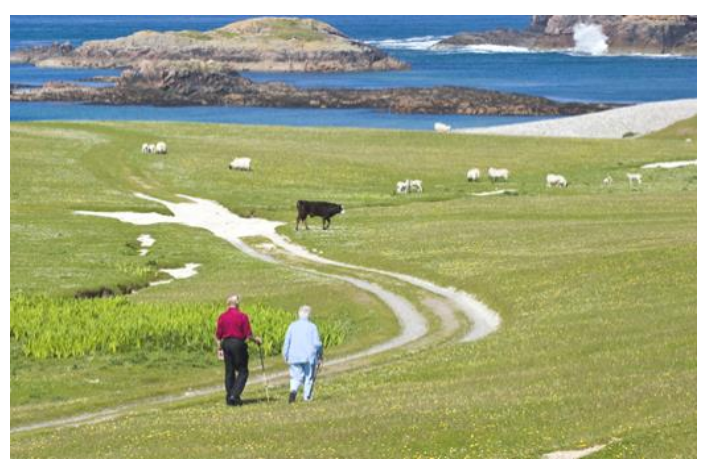
Day 3 - Wednesday 24<sup>th</sup> July Iona - Celtic Quiet Day

After breakfast, Morning Prayer and Address, we will share a day of peace and reflection with scope for informal reflection and discussion and time to read, pray or walk. We will celebrate Communion just before lunch. After Evening Prayer we will dine together.