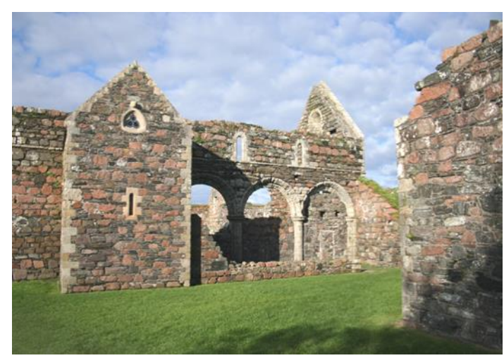
Day 4 - Thursday 25<sup>th</sup> July Jona - Jona's Saints

After breakfast, Morning Prayer and Address, we will share a day of peace and reflection with scope for informal reflection and discussion and time to read, pray or walk. We will celebrate Communion just before lunch. After Evening Prayer we will dine together.